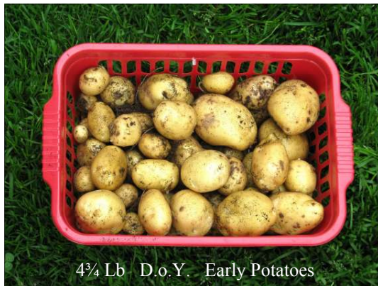
4 3/4 Lb D.o.Y. Early Potatoes

No such thing in those days as Health and Safety, nor minimum wages etc. however there were very few accidents and few complaints, other than towards the gaffers for 'hashing' the pickers with extra long stages and oft times two diggers working the drills. Times have changed and now the only gath-