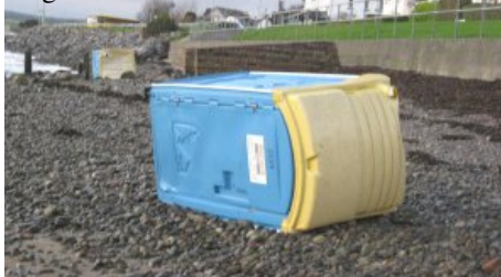
Two of the three loos stranded on Invergordon's High Water Mark!

Fortunately for the insurers, and the workmen, at the time when the plastic loos became airborne apparently they were not in use, otherwise there could well have been fatalities. Could anyone imagine something as degrading as being drowned in a lavatory?