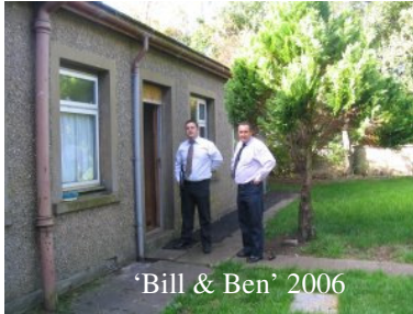
'Bill & Ben' 2006

"Don't be too sure," the lady said as she left chuckling to herself.